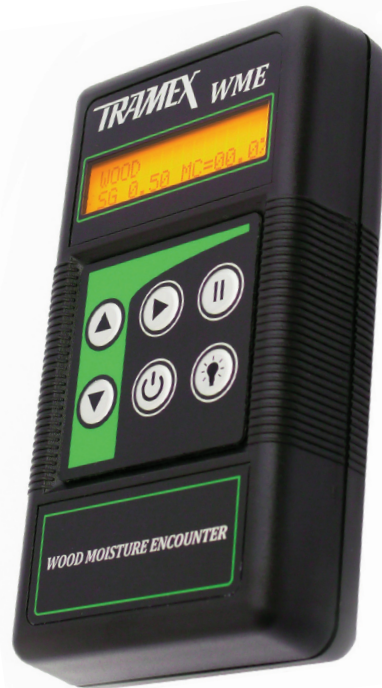
Product order code: WME